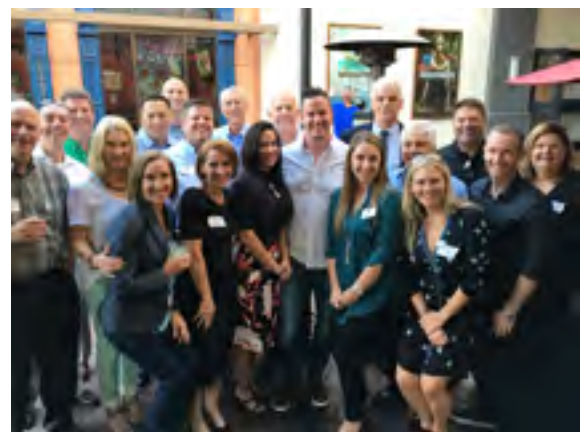
Los Angeles-Area Event