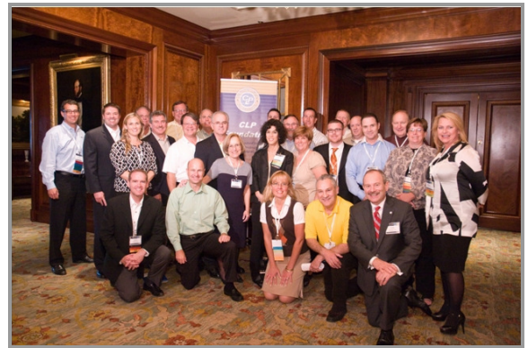
CLPs in attendance at the NEFA Fall Conference in Buckhead, GA