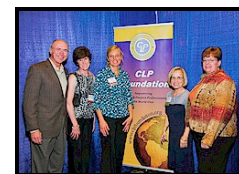
48 th Annual NEFA Convention

We are pleased to announce that the CLP Foundation just returned from exhibiting at the ELFA 48 th Annual Convention in San Diego, October 18 th , 19 th and 20 th . However, you may have visited the CLP Booth in September at NEFA's Annual Funding Symposium in Monterey. Or, perhaps you attended the Introduction to CLP Class at the NAELB Fall Conference in Atlanta. CLP is certifying leasing professionals across the nation and around the globe.