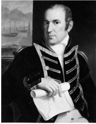
Edward Preble (1761-1807) USS PREBLE's Namesake