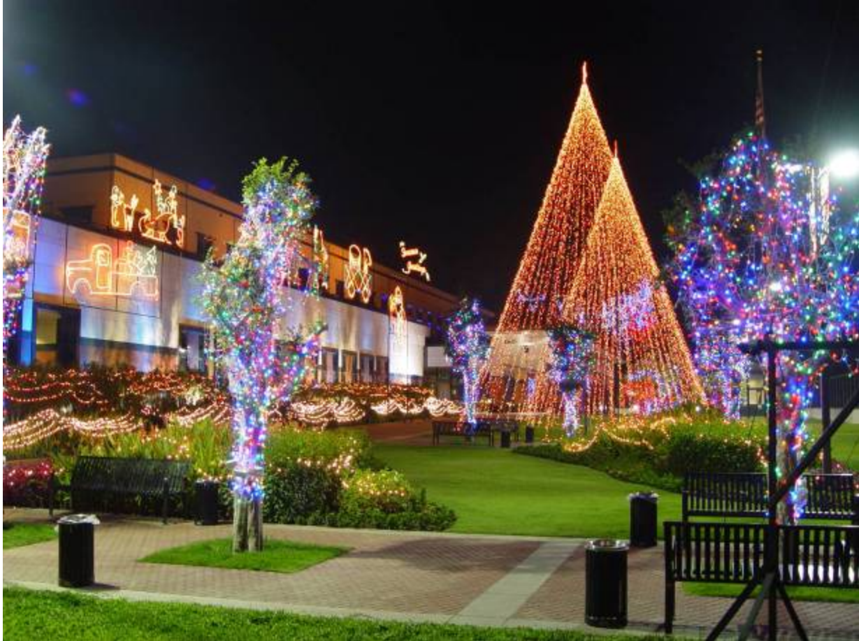
The brightest lights display is the US Embassy.