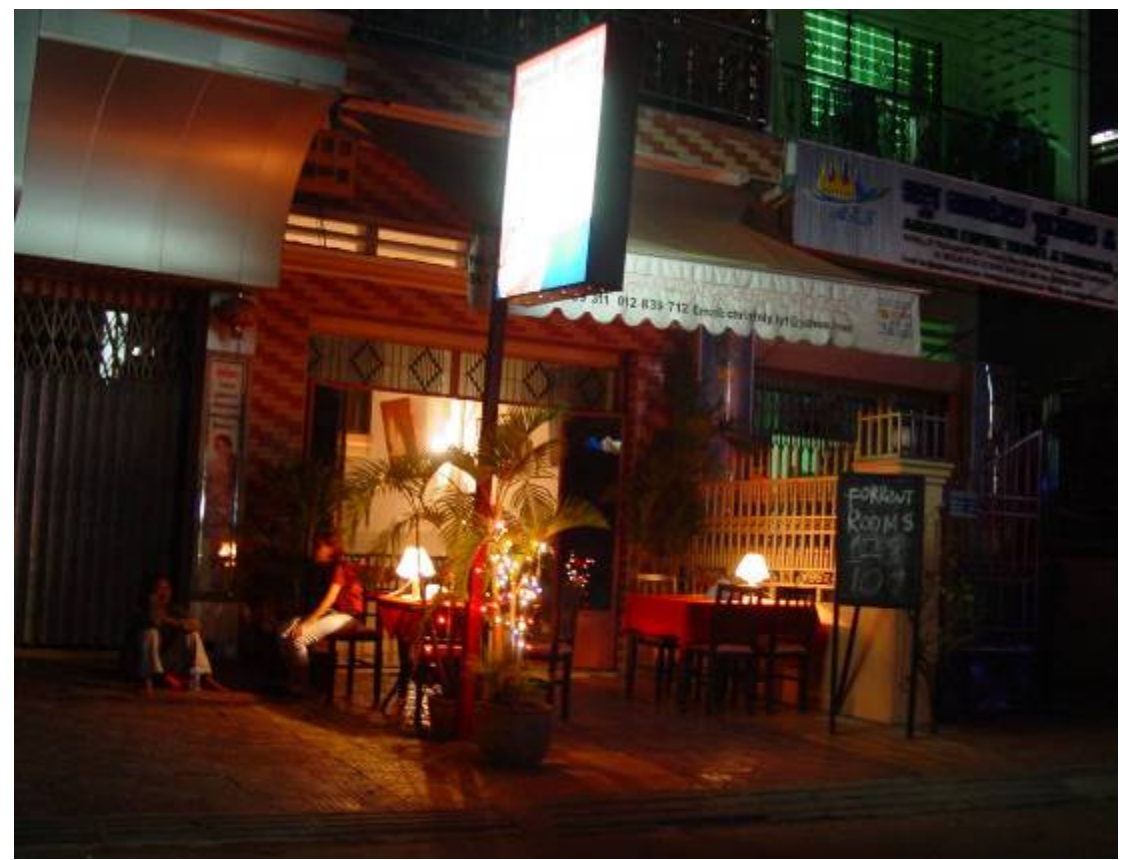
Around the corner from my place is a guest house, café and typical holiday decoration – lights in the palm tree!