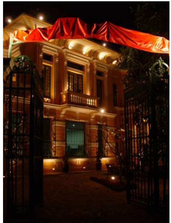
A new restaurant is opening on the 1^{st} floor of the beautiful old building. The 1^{st} floor is one flight up from the street – for my American friends – 2^{nd} floor.