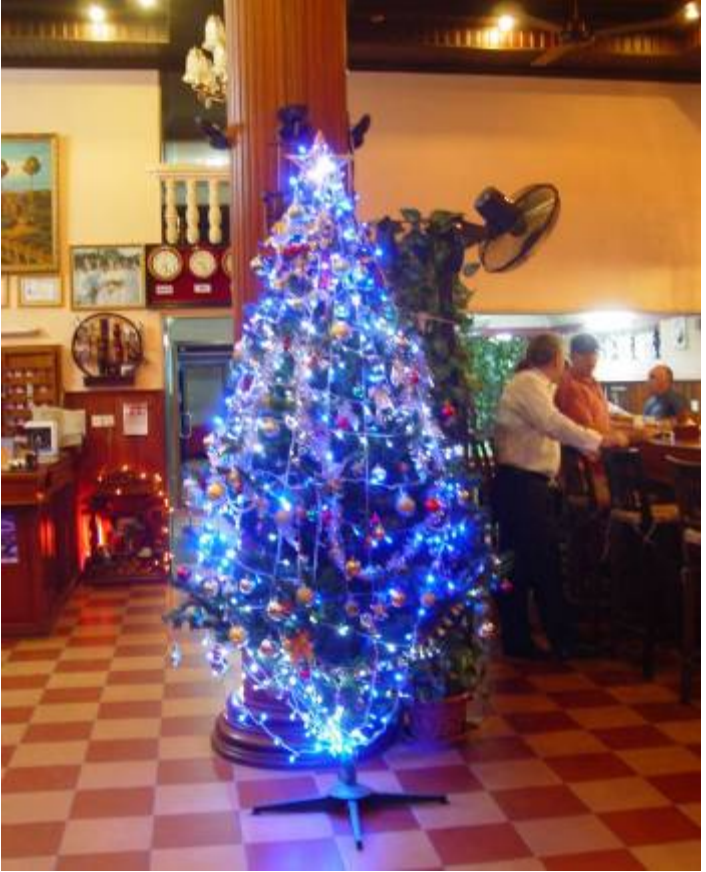
The tree in my hotel lobby.

Hope you and your family are well. As they say in this part of the world "Good Luck to You!" May 2008 be "Same – Same, but Different"!