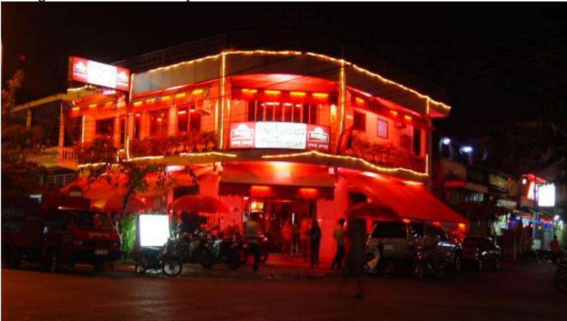
Shanghi looks the same - year round.