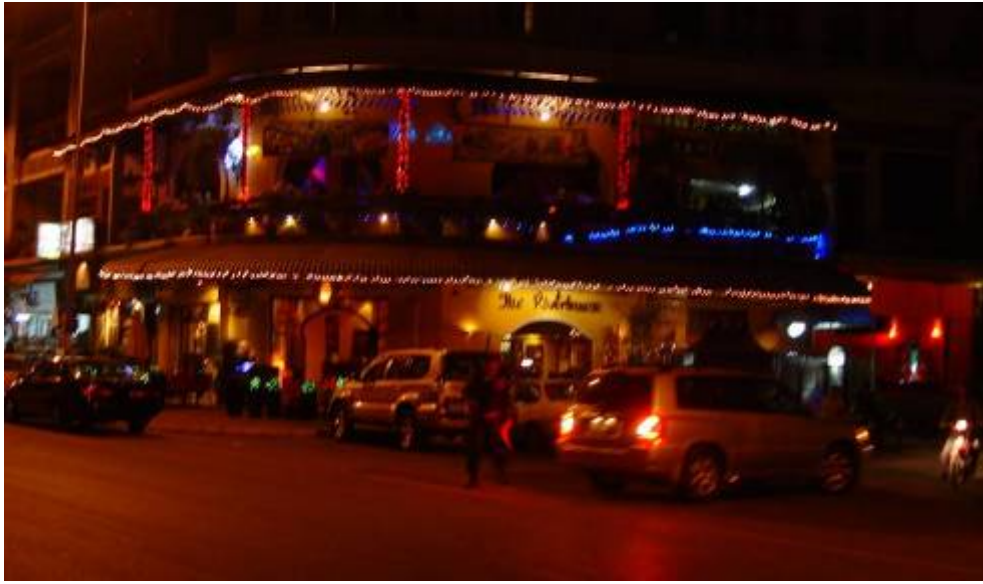
Local bar added a few lights.

Wat Phnom looks about the same. The lights in the forground are actually a huge clock. There is a large "Happy New Year" sign that is not lighted.