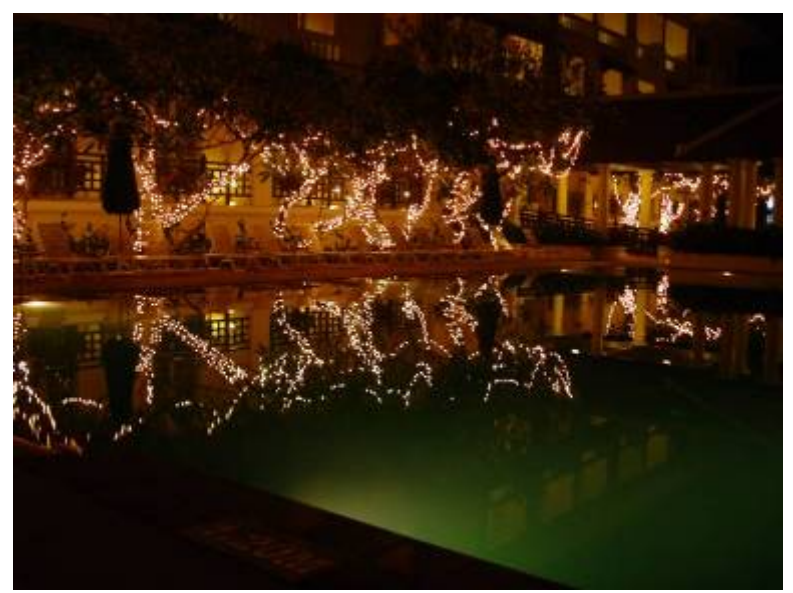
Yes, we can swim on Christmas Day in Phnom Penh.