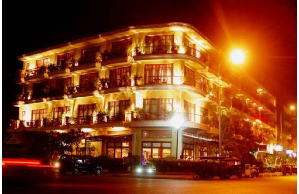
What holiday spirit at some places.