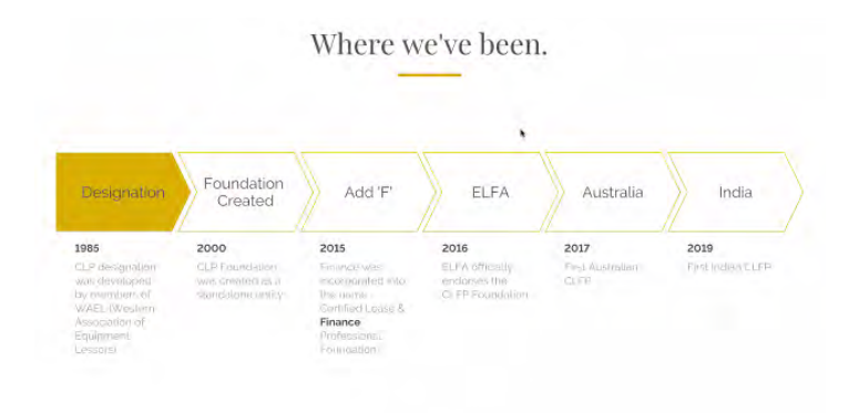
CLFP Foundation Growth