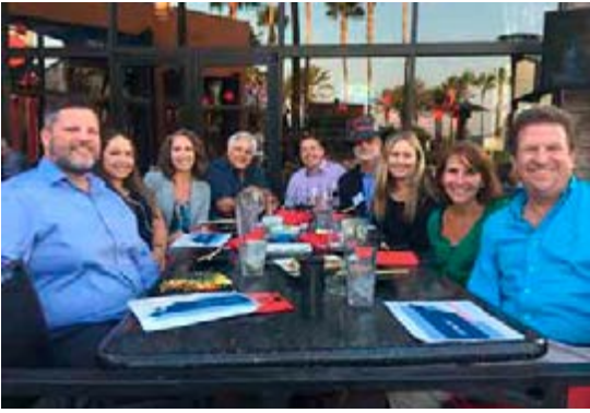
Southern California CLFPs

On August 24, 2017, CLFPs across the country gathered to celebrate their designation. The celebration kicked off earlier in the month when First American Equipment Finance prepared and served a meal at the American Cancer Society's Hope Lodge. Other events were held in Fort Smith, Houston, Bend, Milwaukee, Los Angeles, Minneapolis, Portland, Seattle, Walnut Creek, CA, and Chicago.